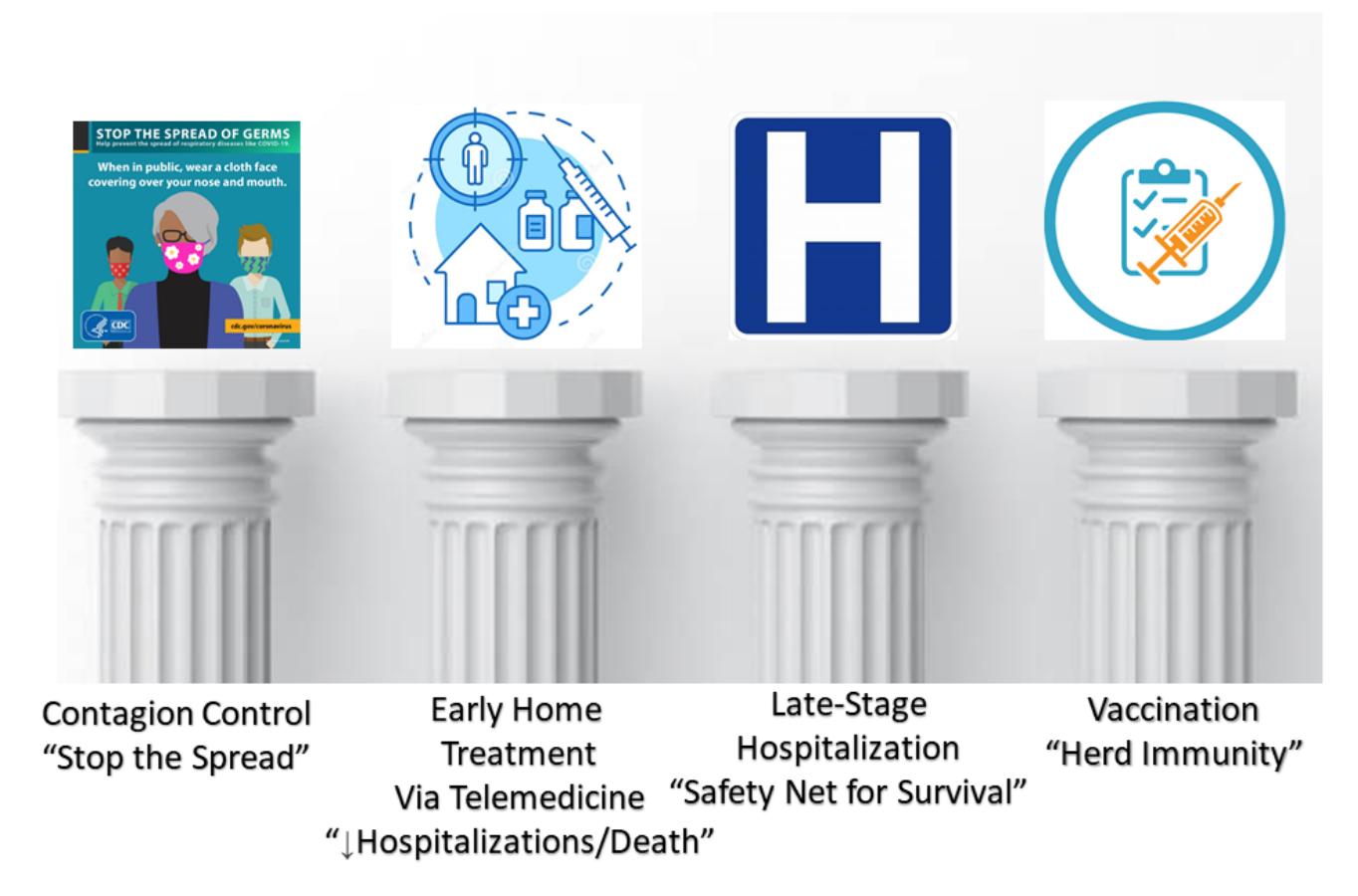
Fig. 1. The four pillars of pandemic response to COVID-19. The four pillars of pandemic response to COVID-19 are: 1) contagion control or efforts to reduce spread of SARS-CoV-2, 2) early ambulatory or home treatment of COVID-19 syndrome to reduce hospitalization and death, 3) hospitalization as a safety net to prevent death in cases that require respiratory support or other invasive therapies, 4) natural and vaccination mediated immunity that converge to provide herd immunity and ultimate cessation of the viral pandemic.

ferson et al., 2020; Xu et al., 2020). Masks for all unaffected contacts within the home as well as frequent use of hand sanitizer and hand washing is mandatory in the setting when one or more family members falls ill. Sterilizing surfaces such as countertops, door handles, phones, and other devices is advised. When possible, other close contacts can move out of the house and seek shelter free of SARS-CoV-2. Findings from multiple studies indicate that policies concerning control of the spread SARS-CoV-2 are only partially effective and extension into the home as the most frequent site of viral transfer is reasonable (Hsiang et al., 2020; Xiao et al., 2020). One of the great advantages of home treatment of COVID-19 is the ability of an individual or family unit to maintain isolation and complete contact tracing. If therapy is offered in the home with delivery of medications, then trips to urgent care centers, clinics, and hospitals can be reduced or eliminated. This limits spread to drivers, other patients, staff, and healthcare workers. On the contrary, therapeutic nihilism on the part of primary care physicians and health systems drives anxiety and panic among patients with acute COVID-19 who feel abandoned, making them more likely to break quarantine and seek aid at urgent care centers, emergency rooms and hospitals.